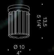
CHARLOTTE P 1xMAX 60W G9

Charlotte is a beautiful industrial style lamp, the body of which consists of a sleek crystal glass which is injected into a mold in order to prevent imperfections. The mechanical nature of its construction resonates with the design, making this piece one of our best sellers. Glass diameter 10cm.